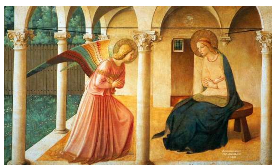
The Annunciation by Fra Angelico (1387–1455)

Angels, announce to man and beast: Him who cometh from the East; Set every peak and valley humming With the word: the Lord is coming! People, look east and sing today: Love, the Lord, is on the way.